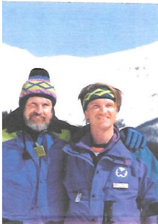
Father & Son 1993

I hope all you Dads have a gentle Father's Day, with a little laughter, some joy and lots of good memories. I hope someone says your child's name and tells you a story about your child. Be easy on yourself, and keep your love ones close.