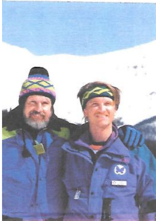
Father & Son 1993

I hope all you Dads have a gentle Father's Day, with a little laughter, some joy and lots of good memories. I hope someone says your child's name and tells you a story about your child. Be easy on yourself, and keep your love ones close.